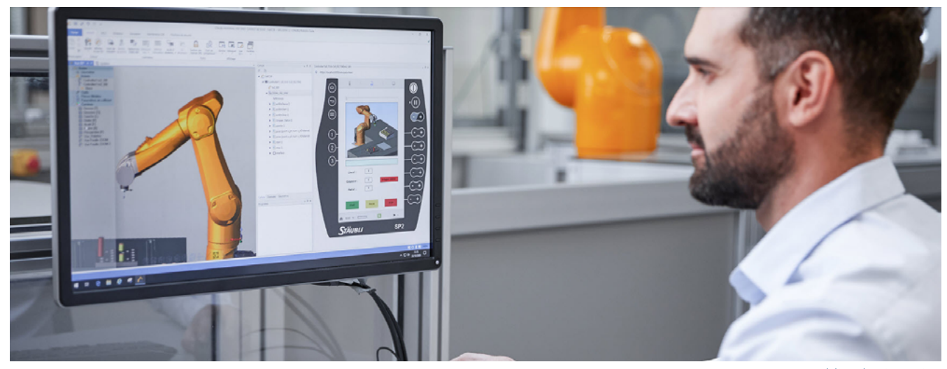
Stäubli Robotics Suite

of a Collision Detection Tool to convert old VRML cells from a previous solution provider. When customizations were needed to fully flush out the workflow, Spatial experts worked on making the necessary improvements.