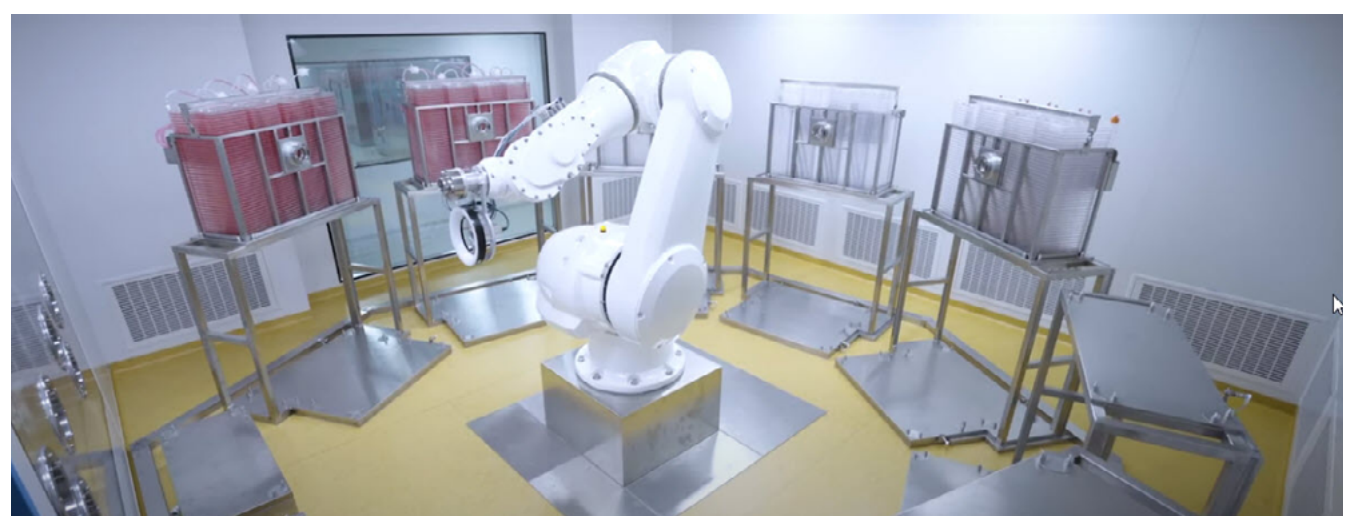
Stäubli Robot Used in Vaccine Production

Spatial's CGM Modeler is the modern, 3D engine that enables these robust functionalities in the Stäubli development